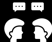
Face To Face Interaction